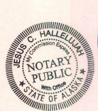
My Commission Expres With Office