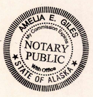
Notary Public My Commission Expires With Office

Subscribed and sworn before me this 7^{4h} day of 2020