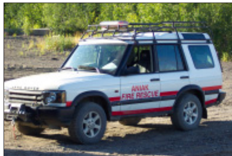
Their Land Rover was presented to them by the Oprah Winfred Show.

Teens from Aniak, Crooked Creek, Chuathbulak, Ruby, Huslia, Shageluk, Grayling, and Russian Mission attended the two-week training camp. They learned rescue skills such as rappelling, water rescue, and firefighting.