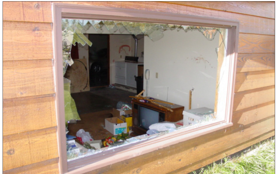
Troopers broke out one of the windows in the residence to give the moose an escape route. Unfortunately, the moose declined to leave and had to be put down.

For Sale Cheap, Very Powerful Lawn Mower...Used Twice. One Owner. SEE "THE MAN":