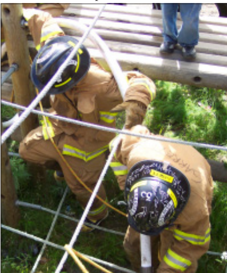
Nineteen students attended the emergency responder training camp.