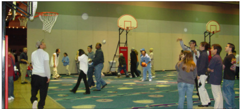
Kids put on Fatal Vision goggles, which distort the vision as if the person had been drinking, then tried to play basketball.

The Army National Guard came in and helped with the games portion of the dance. Fatal Vision goggles were put on the kids so they could see how drinking impaired there ability to play the game, was among the activities. The kids really enjoyed this and kept coming back to play again. ■