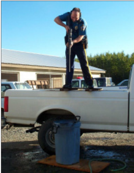
CSI: Soldotna ABWE opened a branch forensic lab to process evidence.