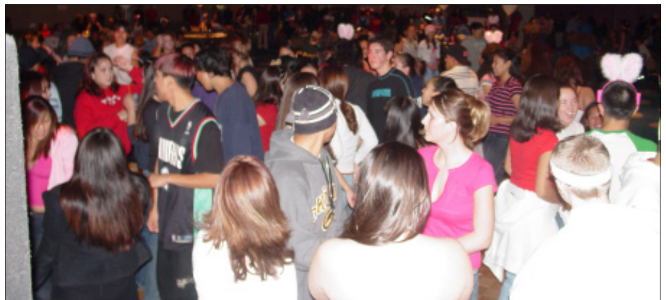
The AFN Youth Dance at the Egan Convention Center.