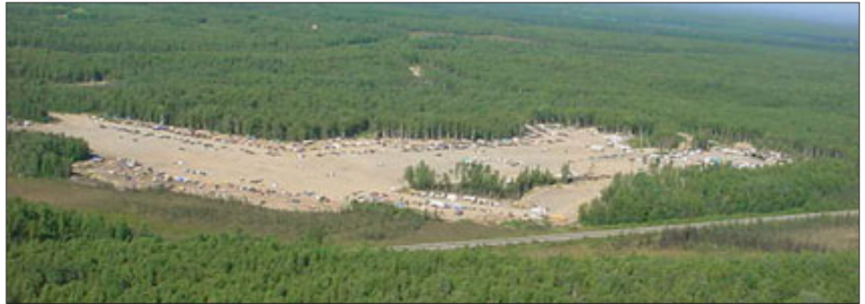
Cars, campers, caravans stretched for as far as the eye could see during the Talkeetna Bluegrass Festival weekend.