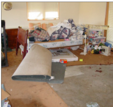
Take one home, add one moose, and try to negotiate its departure. The result: one dispatched moose and a really wrecked room.