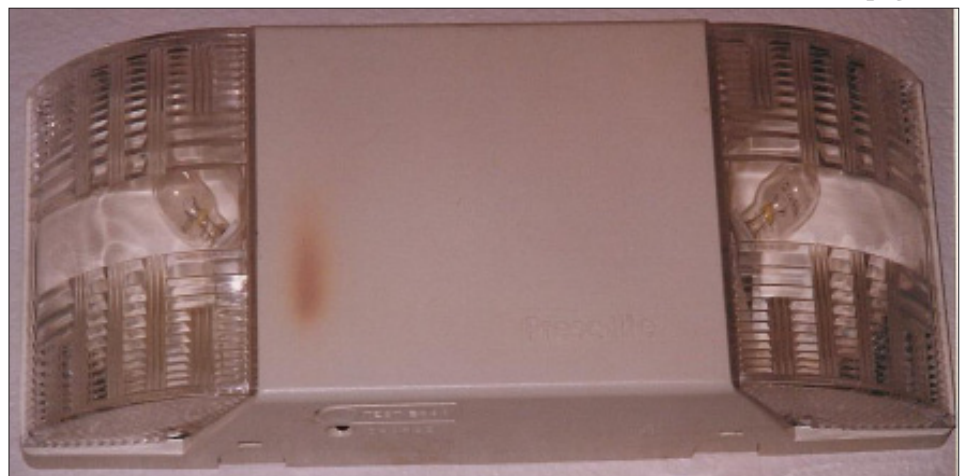
Defective Prescolites were found in a Bethel elder housing complex.