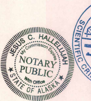
My Commission Expires With Office