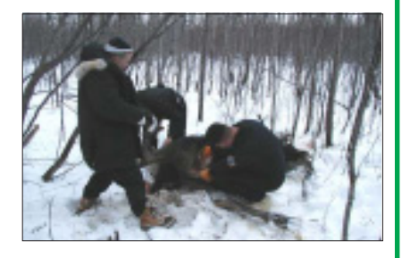
Other Duties As Assigned......11