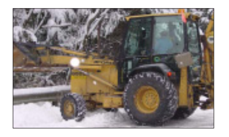
Nome's "Perfect Storm......15