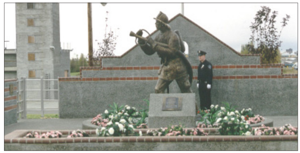
The Alaska Fallen Fire Fighters Memorial is located at the Anchorage Regional Fire Training Center on Airport Heights Road in Anchorage, Alaska.