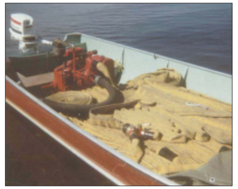
A village fire 'truck'. Where most travel is by waterway, a boat equipped with hose and pump is ideal.

The girl attempted to awaken Bangle without success and was forced to go outside again for air due to the extremely ( History , continued on page 6)