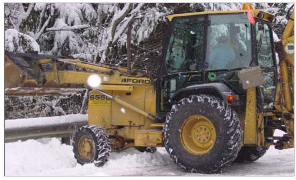
If you look real close, and you can almost make out someone in a blue uniform in the front end loader.

You may notice the huge smile on Linda Deal's face, which means she is thinking, "In a few short weeks I will no longer have to dress for the weather, hope that the snow isn't too high to open the gate, and walk a half a block to the evidence storage facility to store my evidence". The evidence room will actually be located inside the new A Detachment/Ketchikan Post building, scheduled for a move in date of early March.