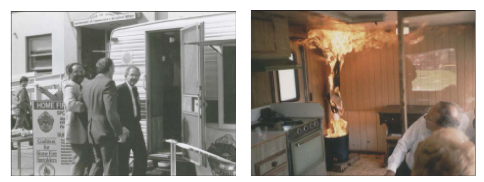
A federal grant provided funds for the purchase of a mobile trailer equipped with a built in residential sprinkler system. The trailer was transported across the state for demonstrations. Former Governor Bill Sheffield toured the exhibit.

ated a grant from the federal government to promote residential sprinkler systems that gave a real boost to the Public Education Program and provided a mobile trailer equipped with a built in residential sprinkler that could be hooked up with a domestic water hose. The demonstration trailer toured the state from late 1986 through 1987.