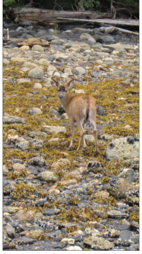
Knowing it had a 'good thing', the deer was reluctant to get out of the boat and back on shore but with some coaxing, he finally agreed to go.