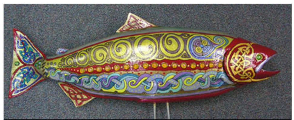
After a trip to the taxidermist, "Celtic Warrior's" head and tail were repaired and, with some fresh paint by O'Keefe, it was back in the 'running'.