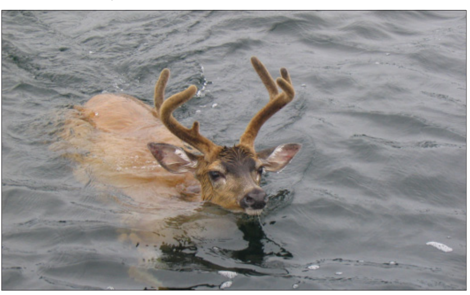
Trp. Jeremy Baum observed a deer while on patrol in the Thorne Arm area. When the deer saw him, he began swimming toward the boat. (See back page photo.)

On July 9, 2004, Trp. Jeremy Baum was patrolling the Thorne Arm area aboard the P/V Whaler , when he observed a black tail buck in the water about a mile from shore. As he approached, it was obvious that the deer was having a difficult time swimming and keeping its head above the water. When the deer saw Trp. Baum, it immedi-