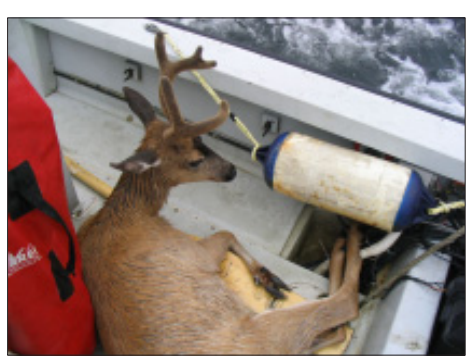
Trp. Baum was able to get the deer out of the water and into the patrol boat for a short ride to shore.