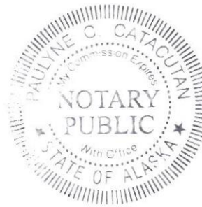
Notary Public My Commission Expires With Office

Subscribed and sworn before me this 21 day of 11 , 20 25