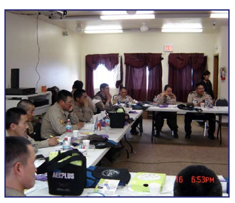
VPSO's in Training