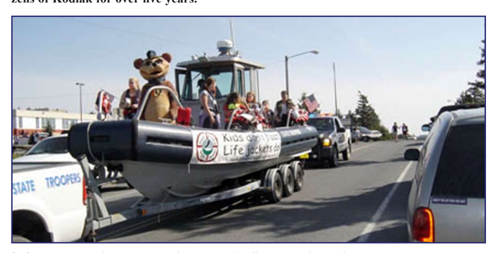
Safety Bear making sure all things are a "go" on the P/V Ethics.