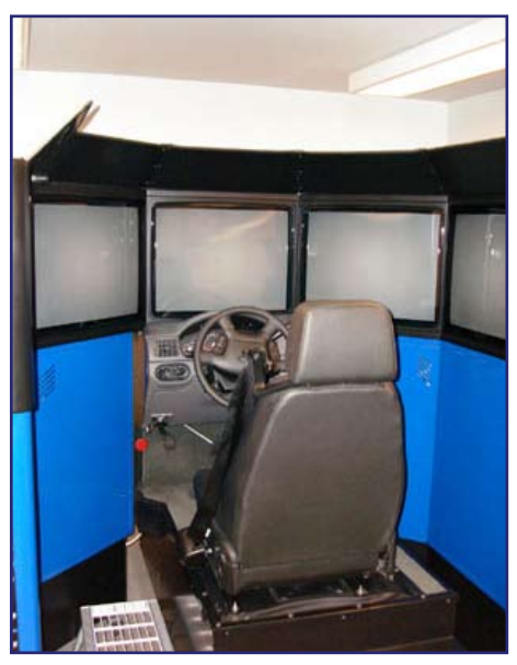
Factory reps assembled the simulator in less than a day.