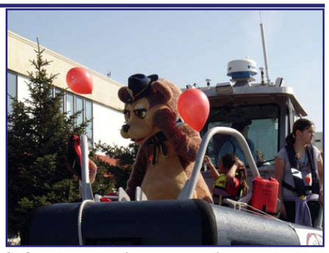
Safety Bear having a great time at the Kodiak Crab Festival parade.