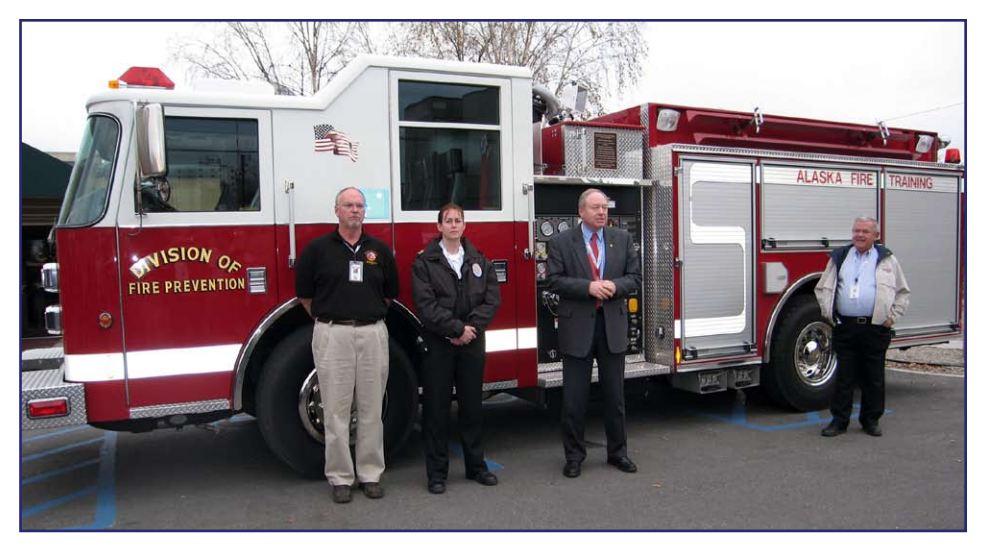
New Fire Training Engine

The Alaska Division of Fire Prevention proudly received its new state of the art Fire Engine for the Fairbanks Regional Fire Training Center. The new engine was purchased from Pierce Manufacturing and has several design features to help train new driver/operators. The Training and Education Bureau put on a short demonstration of the engine's capabilities for everyone willing to brave the rain in back of DPS Headquarters.