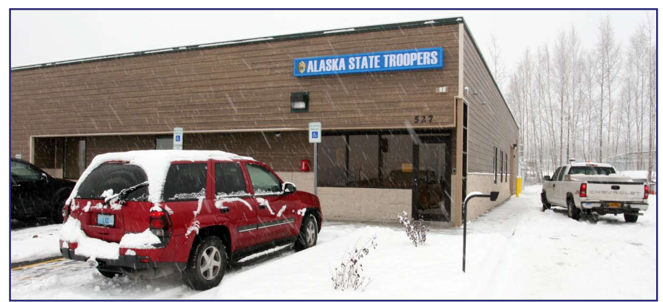
The new Mat-Su West Trooper post at mile 49 of the Parks Highway

The biggest news for "B" Detachment is the opening of the new Mat-Su West post. It is located at Mile 49, Parks Highway in Wasilla. It is approximately 11, 700 square feet. There is a heated garage, yes heated, a huge conference room, an evidence processing area, two interview rooms, and a big squad room. Units in the new building include Patrol, DUI Team, ABI Investigators, and ABWE. We had an open house for the public on October 30th, there were at least 100 people in attendance. We will now be able to provide better service to the west side of the Valley.