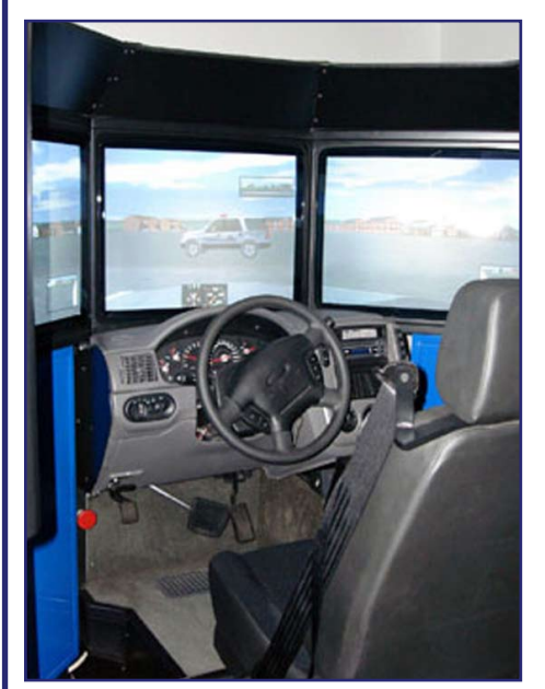
Some features of the new system are the full motion seat

The Corporals will be able to create different driving scenarios that will assist in hazard perception, speed and space management, adverse weather driving conditions, multi-tasking and split second judgment, and decision-making. The staff at the Academy is all geared up and ready to start using this new driving simulator with ALET #36. ■