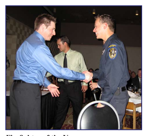
Firefighter of the Year

Fire Service personnel are nominated for the awards by their peers. The nominees must demonstrate an extraordinary commitment to firefighting, fire prevention, fire training and leadership.