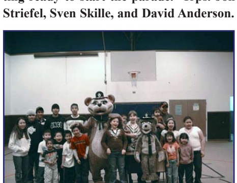
Safety Bear and Ted E. Bear with students from Akhiok.