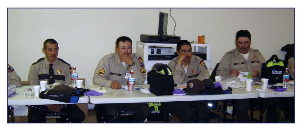
VPSO Regional Training was held in Bethel during the week of October 23rd - 27th.