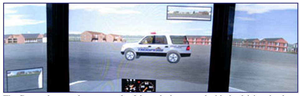
The Corporals spent the next couple of days playing around with the driving simulator doing what they could to make it crash!