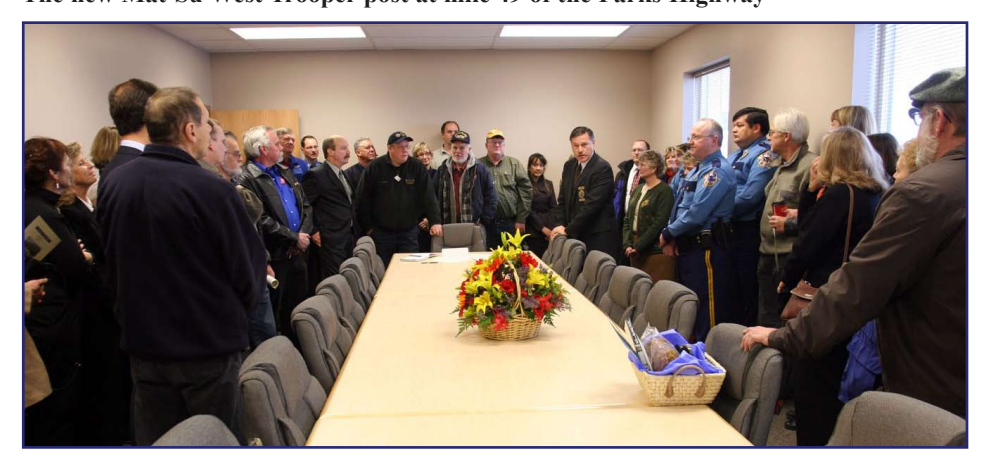
The official opening of the Mat-Su West Post