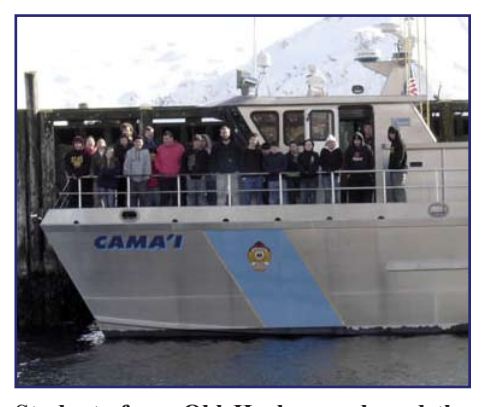
Students from Old Harbor on board the P/V Cama'i.

We started out the trip with a visit into the Village of Ouzinkie and continued on to Port Lions, Larsen Bay, Akhiok and Old Harbor. Karluk was again bypassed due to bad weather. We gave two presentations at each school. The mornings were devoted to the younger grades, K-6 and younger. In the afternoons, we tried to give the high school group an overview of our mission and of all the different types of equipment we use.