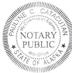
Notary Public My Commission Expires With Office

Subscribed and sworn before me this 09 day of 10 , 20 25