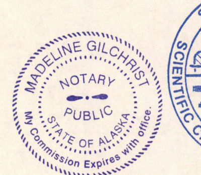
My Commission Expires With Office